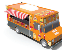
LARGE FOOD TRUCK