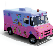
SMALL FOOD TRUCK (16' x 7')