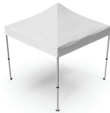
10' x 10' POP-UP TENT