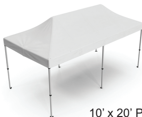
10' x 20' POP-UP TENT